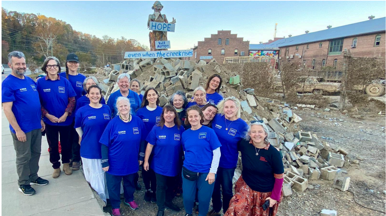
Team Kairos, USA - River Arts District, Asheville