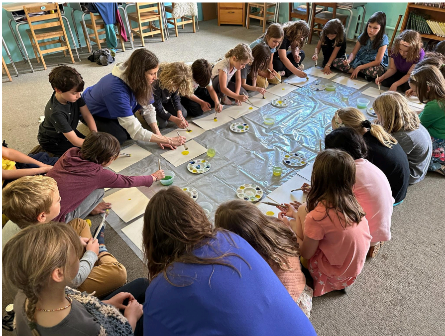
Painting with 7-9 year old group - Asheville Waldorf School Intervention Site