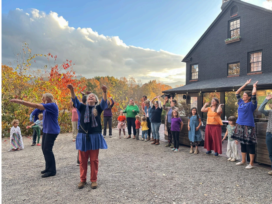
Peri Social House - Black Mountain Intervention Site