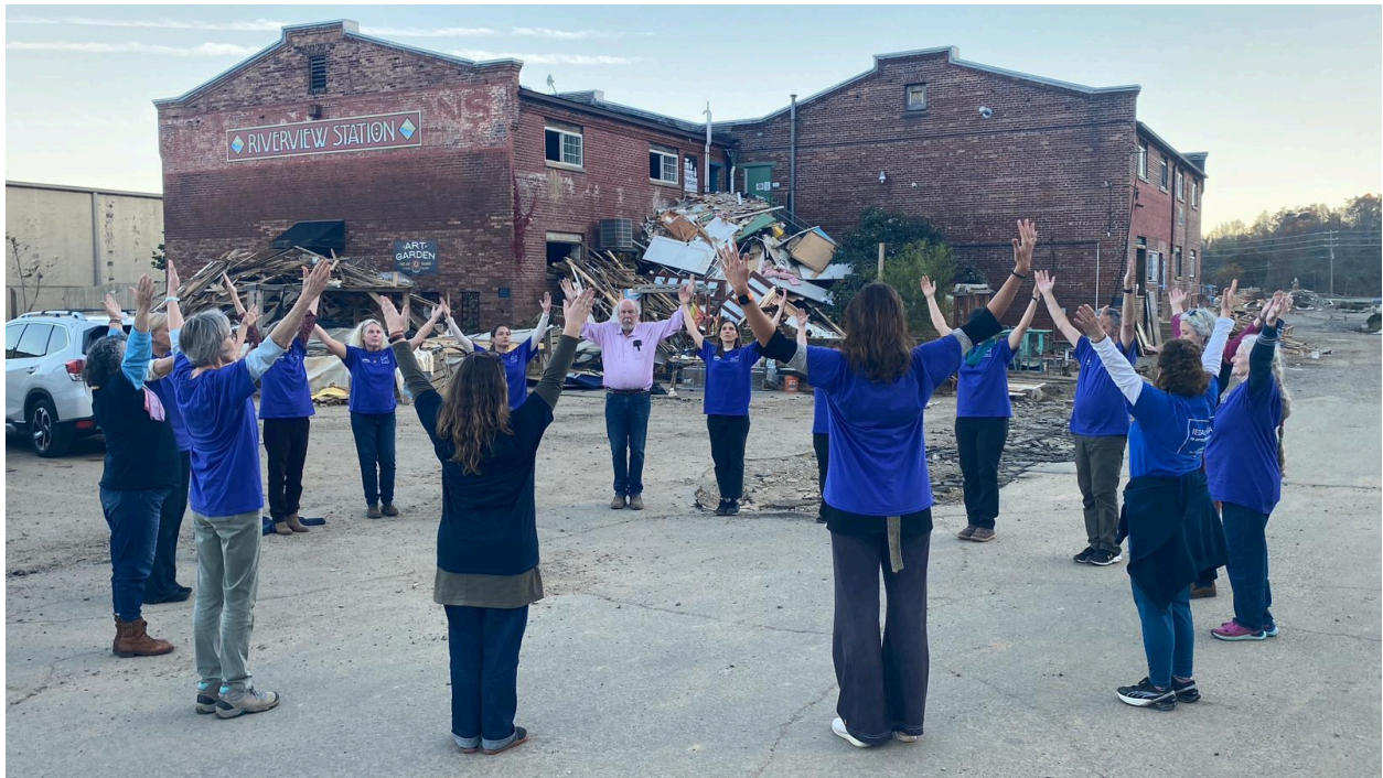
Hallelujah Team Kairos, USA - River Arts District, Asheville