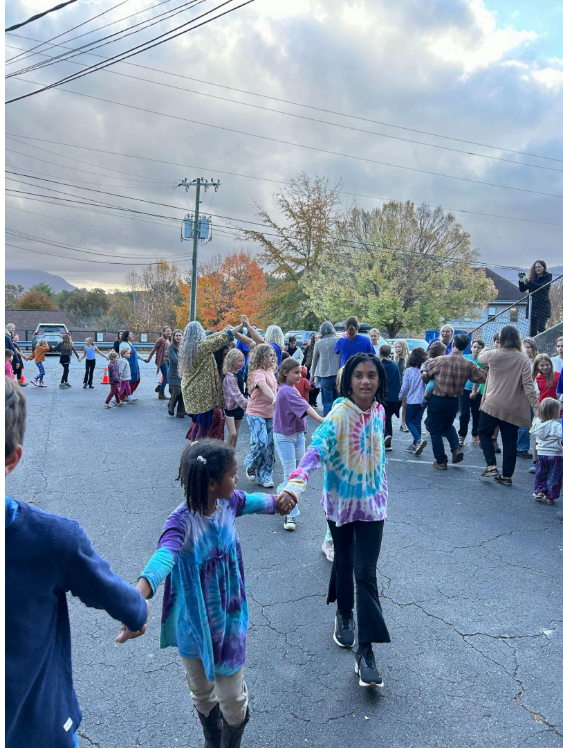
Closing Circle - Asheville Waldorf School Intervention Site.