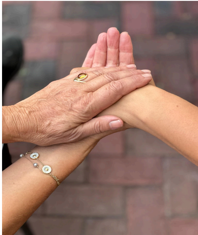
Healing hands at Peri Social House - Black Mountain Intervention Site