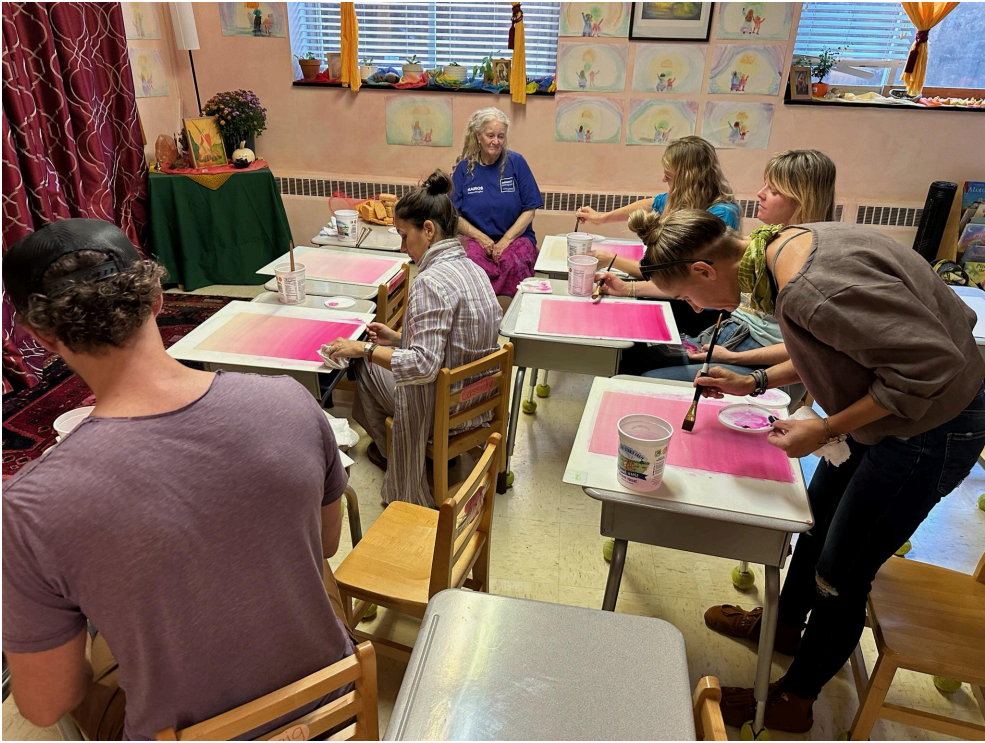
Parents painting Magenta - Asheville Waldorf School Intervention Site