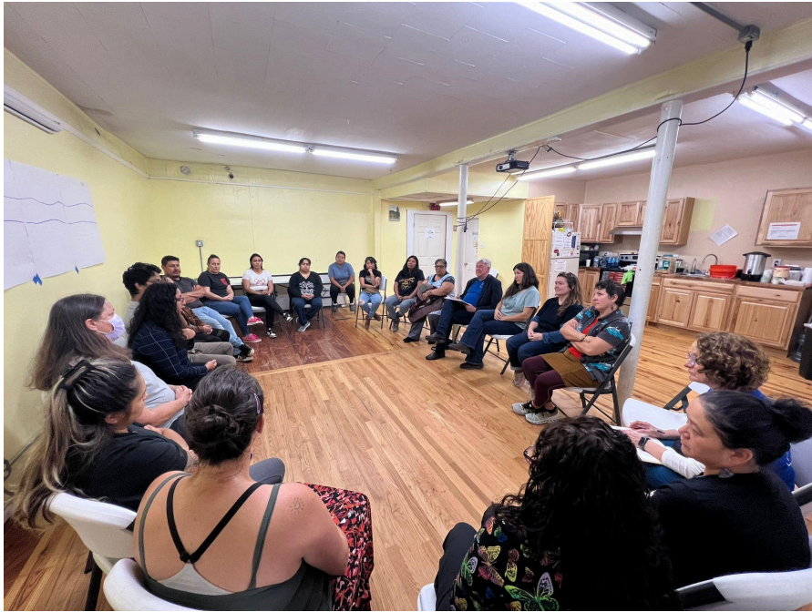
Parent lecture, Colectivo La Milpa and Cooperativa Buganvilla - Latinx Intervention Site