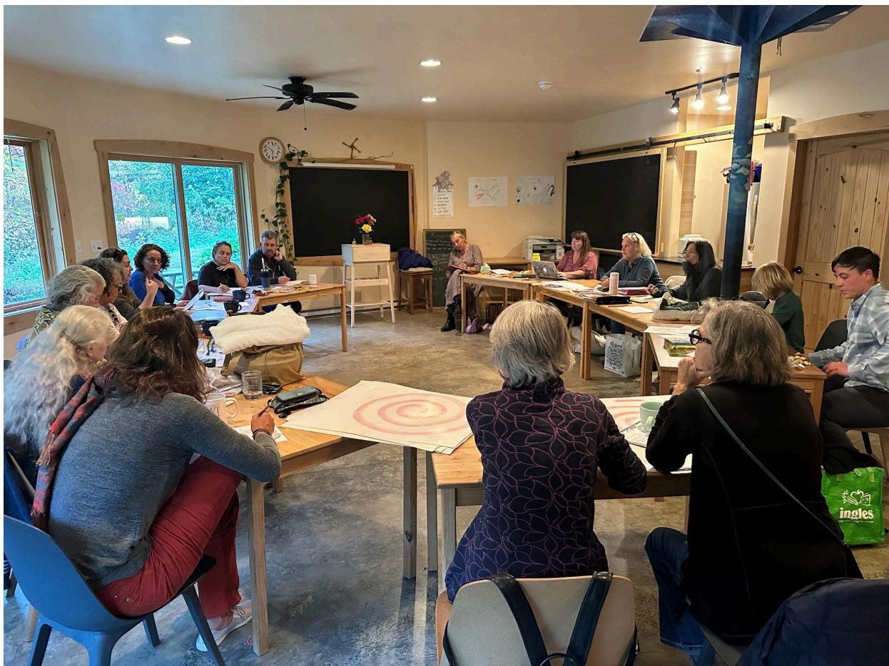
First Team USA meeting - Sanctuary of Living Arts, Housing and Intervention Site