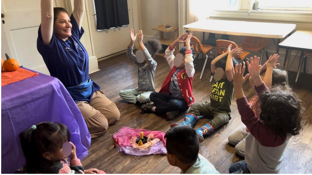
Movement games at Colectivo La Milpa and Cooperativa Buganvilla - Latinx Intervention Site