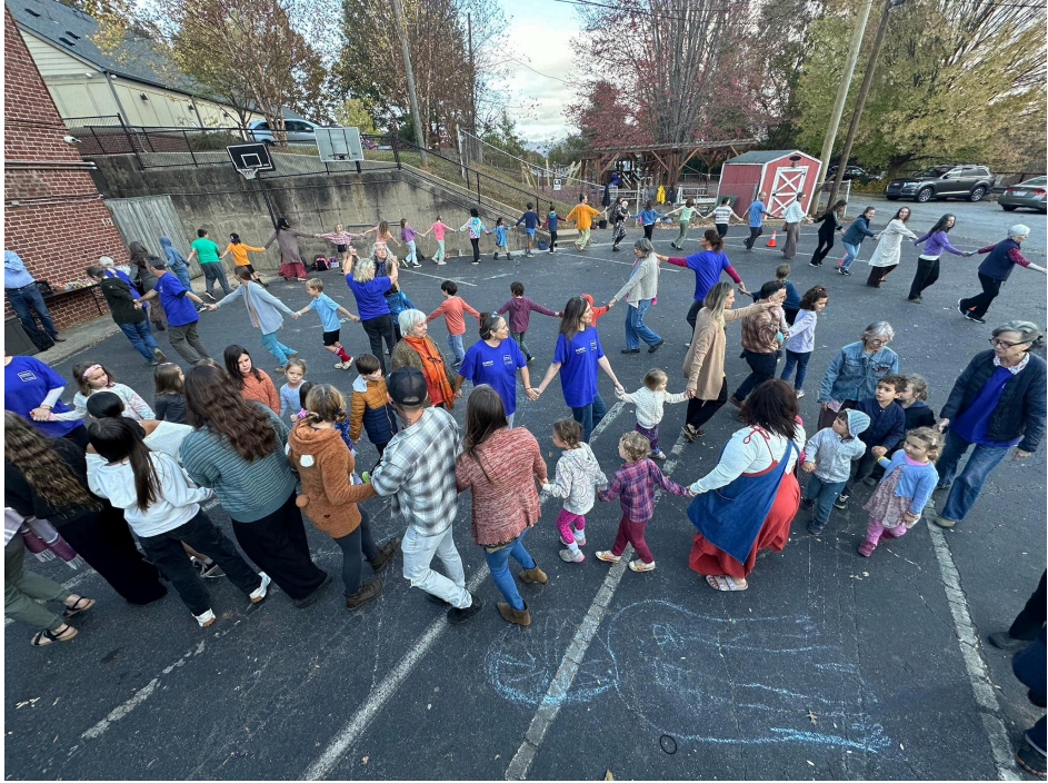
Opening Circle - Asheville Waldorf School Intervention Site