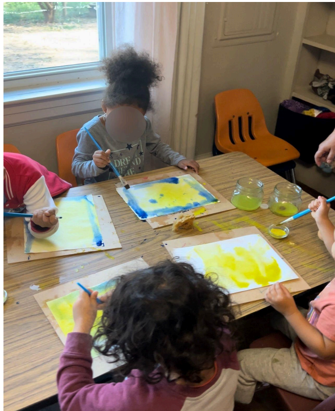
Painting with children at Colectivo La Milpa and Cooperativa Buganvilla - Latinx Intervention Site